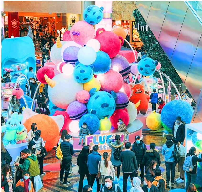
Disney and Pixar — Fluffy Festival held at Langham Place Mall was well received by customers